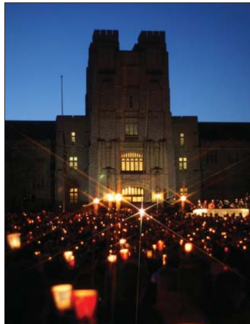
Virginia Tech Candlelight Vigil.

to inform the public in a timely and comprehensive manner when such an event occurs. It makes sense that colleges across the country learn from Virginia Tech's incident and put into place appropriate changes to improve organizational systems. [Our university has created Mason on Alert, a website to inform people of internal or external crises.]