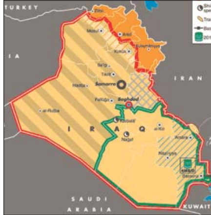
Map above shows partition plan for Iraq.

among groups, this paradigm tells us how important it is to know that one can share certain feelings with an out-group, such as victimhood, fear, glory and accomplishment. Social activities thus can serve as a catalyst for the sharing of these kinds of feelings and perhaps heal deep scars and reduce ongoing violence. ■