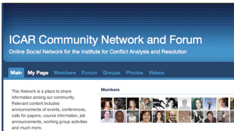
Above: ICAR Forum Homepage. Lower Left: Calendar. Lower Right: ICAR Groups.

The Discussion Forum features postings by scores of people and includes entries ranging from announcements of events (ICAR and external), courses, grants, scholarships, and conferences to discussions on current events and items for sale. This is the easiest way to spread the word to the ICAR community about almost anything you can think of. Pages created by individuals add a layer of personal connection and help with the matching of names and faces in our growing community. This is also a great way to share stories and experiences about your work and life with people