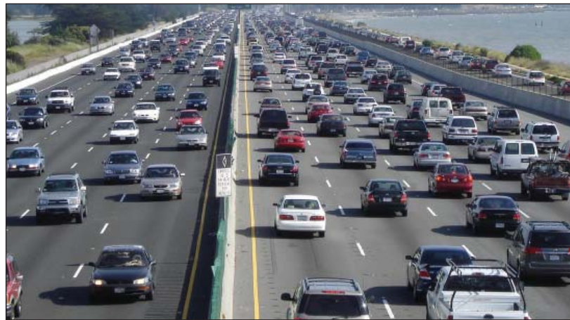
Above: Drivers trapped in a traffic jam creep along slowly.

For the past few years, debate has been raging among Virginia officials on how to solve the state's transportation crisis. The governor offers plans to build more roads and improve public transit. Some legislators and community activists object that the plans are too expensive and would require large tax increases. Others believe that they do not go far enough towards