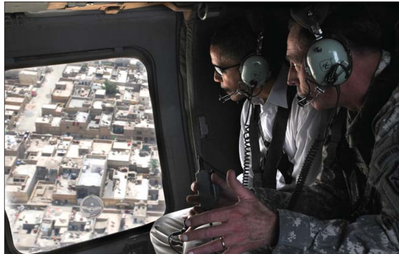
Above: Barack Obama with General David Petraeus in Iraq.

In his victory speech on November 4, 2008, President-elect Barack Obama appealed to our best selves, reminding us of an America acting from a sense of moral principle, an America that seeks to redress injustice at home and tyranny abroad. He called us to face our current crises from a shared sense of moral purpose. But I wonder whether he