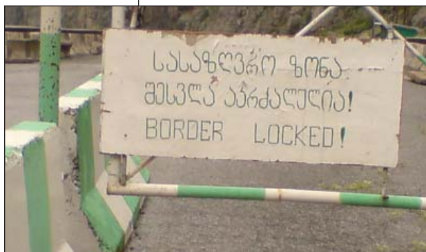
Above: Border fence between Russia and Georgia.